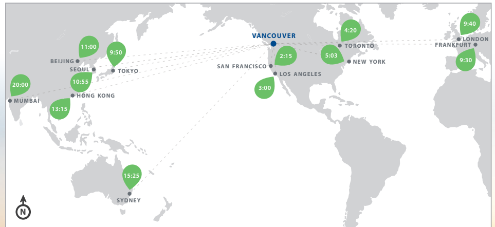
Hour Air Travel Times from Vancouver International Airport

British Columbia's aerospace sector is globally recognized for its excellence in delivering highly specialized products and services, supported by a network of educational institutions that provide a deep pool of highly skilled talent. With close proximity to Boeing's final assembly lines in the Seattle area, British Columbia bridges space and culture between the Asia Pacific, and Pacific Northwest and Canada's growing aerospace industry.